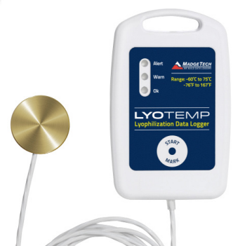
Compatible with the HiTemp140X2-FP data logger series, HiTemp140-FP data logger and the LyoTemp Data Logger.